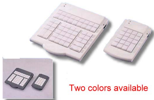
Two colors available

※ Specification is subject to change without notice.