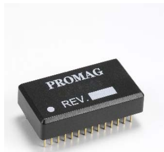
RWM600 Reader Module

※ Specification is subject to change without notice.